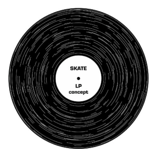
Fig 1. Skate

'Taking the anti-skate function of a record player as its beginning the [Skate] concept breaks down the nature of the record as a continuous terrain by cutting only small isolated arcs of texture/sound into the record. I do this by forcing sound backwards through a modified wind up 78 player [to become the 'Gramophone Lathe'] so the needle cuts instead of plays the disc. During playback the stylus becomes free to roam either where it likes across this surface or as it's user determines' Schaefer (2002). The intervention into the traditional printing process of vinyl generates an opportunity to stand outside of a predictive narrative and provides us not with a single track of sound that we may follow, but a never ending random sound track that neither the author or listener knows where it will go.