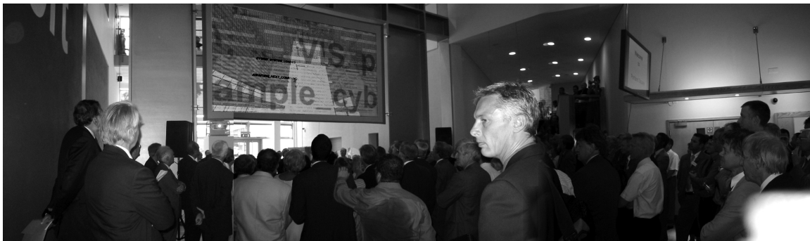
Figure 2: The boot up sequence of the Portland Square Arch-OS, at the buildings opening ceremony performed by Lord Owen, July 15 2003

The perception of the self within the complexity of the Arch-OS Core Model is problematic. The body exists within a fractured space-time architecture: sitting in a room and viewing the larger space of the networked building as a real-time 3D model can be both disorientating and exhilarating. The viewer is both within the model and removed from it. When this model of interaction is layered across several networked buildings utilising Arch-OS, the problems created by asynchronous activity increase dramatically. Geographical distances dissolve into the Core Model and social interactions, conversations and gazes are extended over longer periods of time, or compressed into a fraction of their normal length. Arch-OS effectively shares rooms in the same way that files are shared over a network. Arch-OS can model and control the implosion of space and time, the shrinking of distances and the multiplicity of moments that occur within a building or geographically separate buildings.